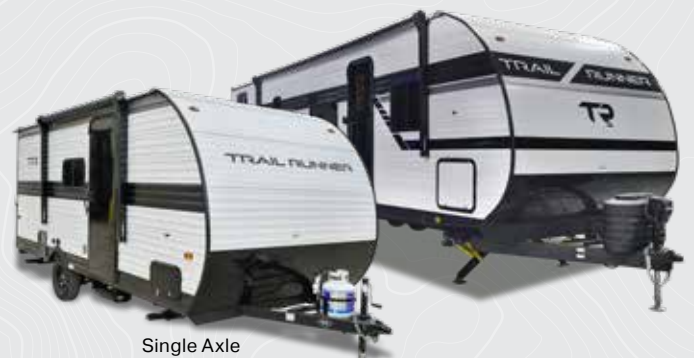
Single Axle 117R and 171BH

Product information is as accurate as possible as of the date of publication. Due to Heartland's commitment to continuous improvement, photos may show optional equipment or props used for photography purposes only. Heartland has listed the approximate length of the vehicle. Vehicle Caution: Owners of Heartland recreational vehicles are solely responsible for the selection and proper use of tow vehicle, selection, operation, use, or misuse of a tow vehicle. Heartland's limited warranty does not cover damage to the recreational vehicle's body length of the trailer including hitch, meaning bumper to hitch (pin) It does not include the rear ladder of the spare tire.