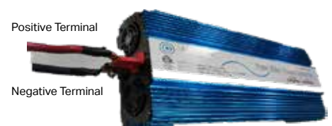
3 | Connecting Positive and Negative Gauge Wire on the Inverter