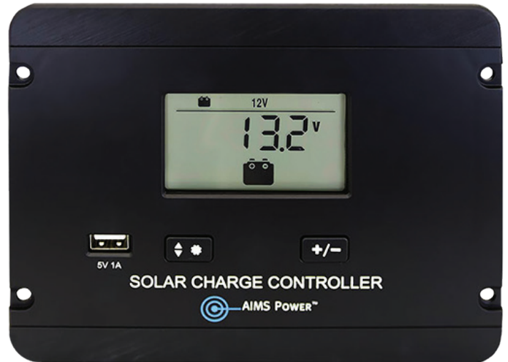
30 Amp Charge Controller