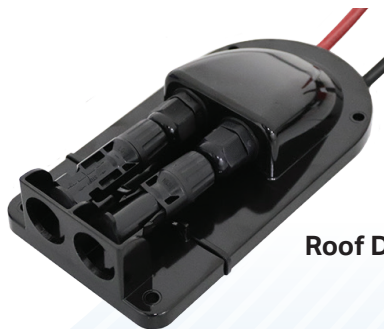
Roof Docking Port