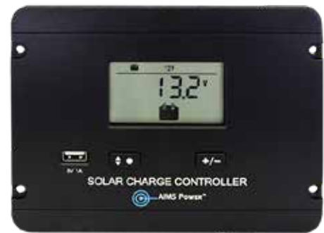
30 Amp Charge Controller