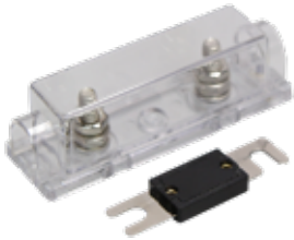
200 Amp Charge Inverter Fuse Kit