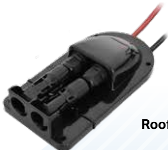
Roof Docking Port