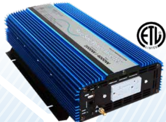
2000W Power Inverter