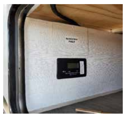
1 | Access Panel