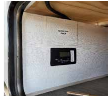
1 | Access Panel