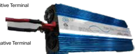
3 | Connecting Positive and Negative 2 Gauge Wire on the Inverter