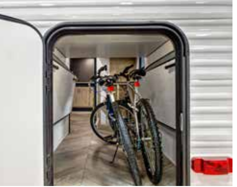
Mega Pass-Thru Storage

8 Cu. Ft. Gas/Electric Refer IPO 10.7 Cu. Ft 12V Refer (N/A 290BH)