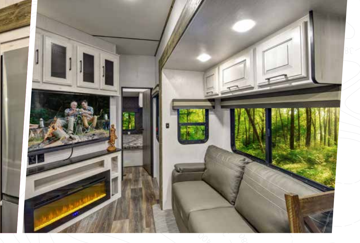
LENGTH: 43<sup>°</sup>0<sup>"</sup> | HEIGHT: 13<sup>°</sup>4<sup>"</sup> | HITCH: 2,710 LBS. DRY: 13,650 LBS. | GVWR: 15,500 LBS. | SLEEP CAPACITY: 3-4