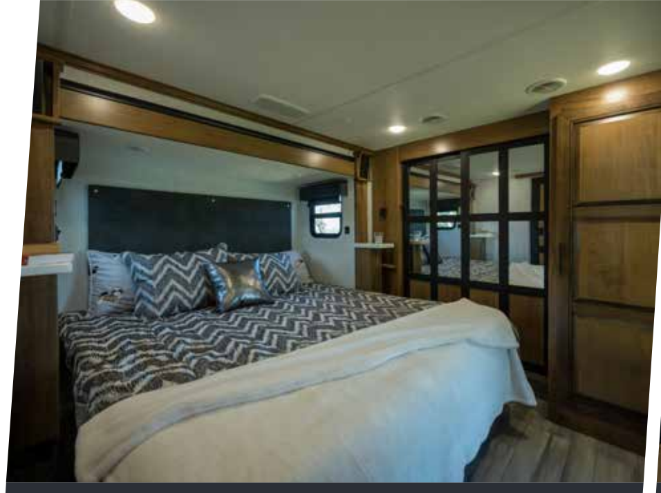
The luxurious bedroom suite features a king bed with under-the-bed storage, builtin closet system featuring hanging clothes rod and recessed shelving along with 2 windows for better air flow.