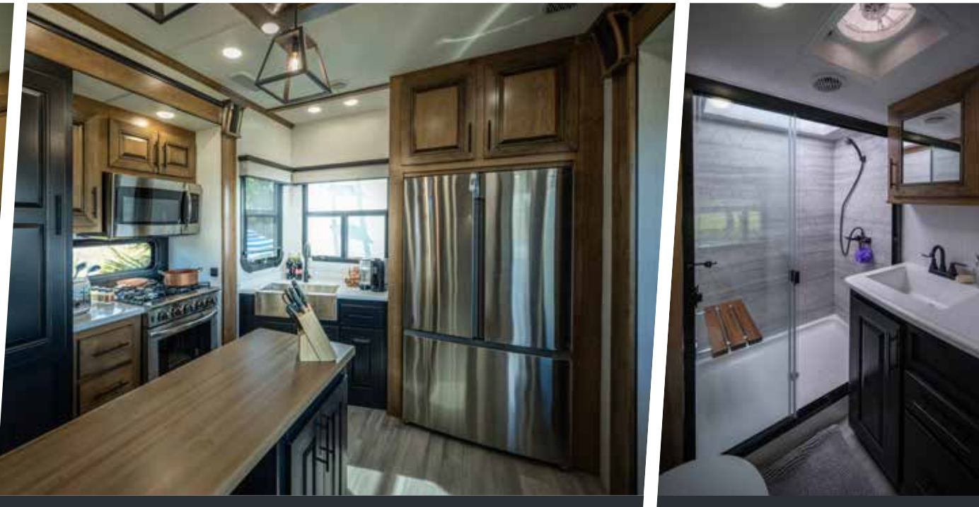
The beautifully redesigned Bighorn interior features 2-tone black and tan maple cabinetry, residential size refrigerator, 3 burner gas cook top with oversized oven, 30<sup>°</sup> microwave and many more beautifully designed standard features.