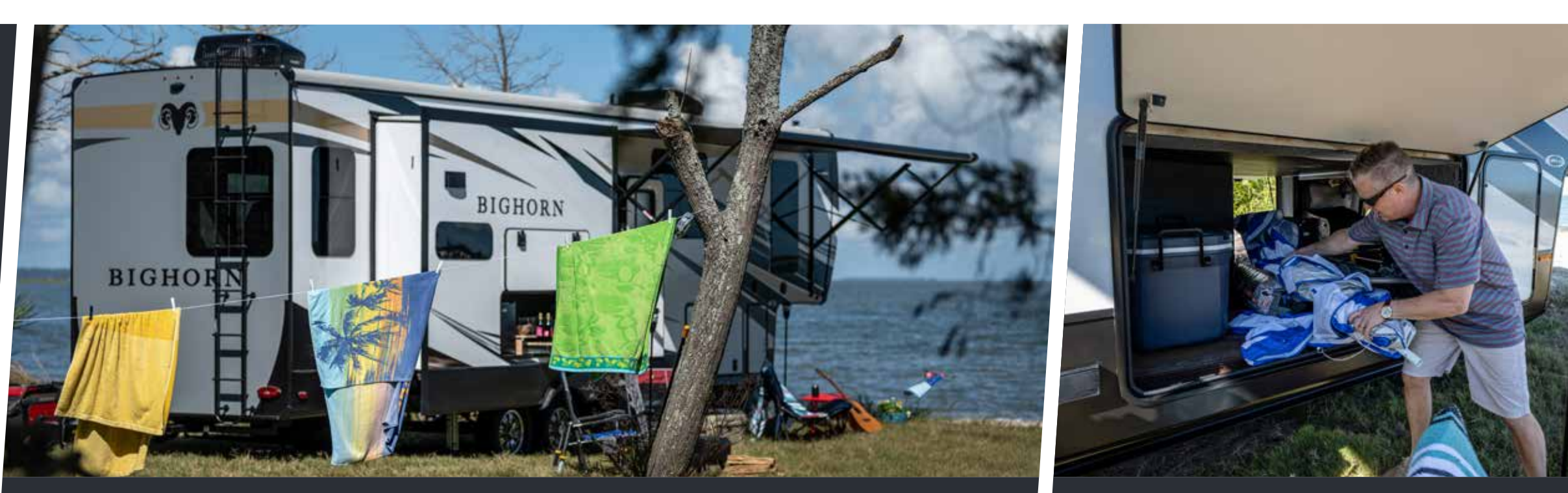
The Azdel composite and aluminum components of our sidewalls create a strong, lightweight, quiet, weather and temperature resistant wall that will increase the life of your RV.