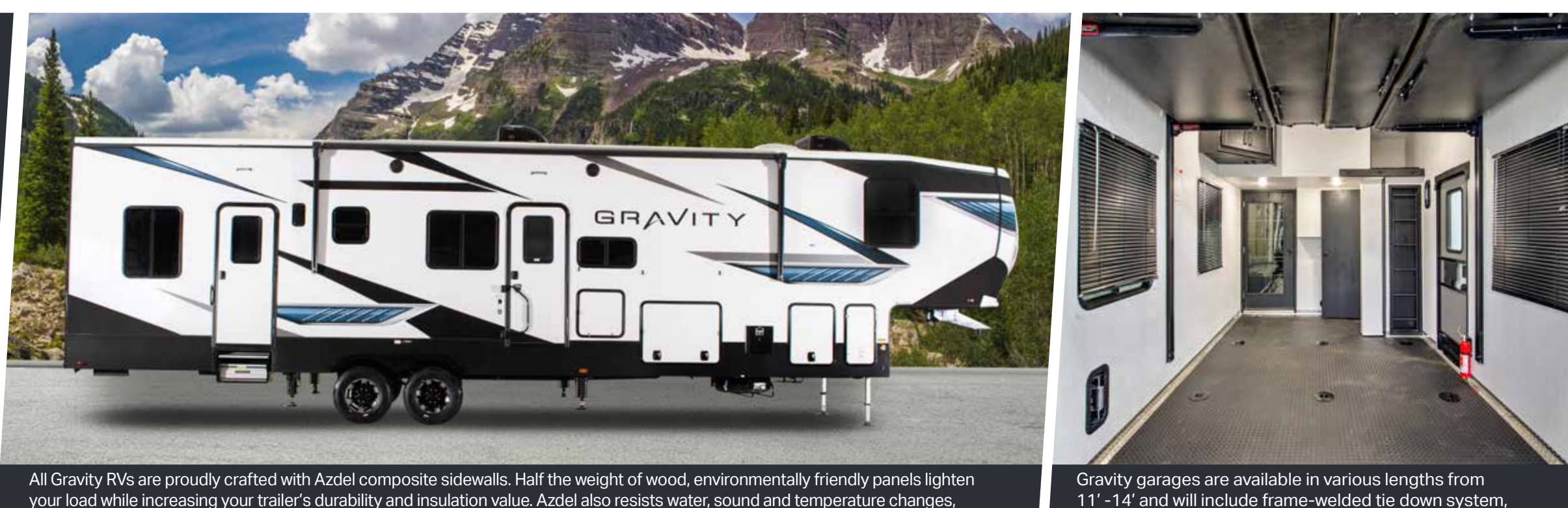
your load while increasing your trailer's durability and insulation value. Azdel also resists water, sound and temperature changes, keeping your living spaces comfortable and quiet.