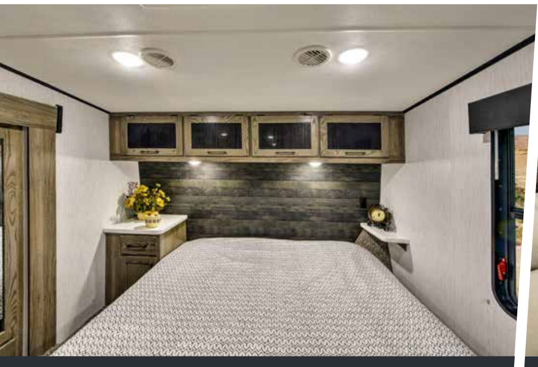
Master suites featuring a beautifully designed headboard with king size bed with overhead storage and bedside wireless charging station.