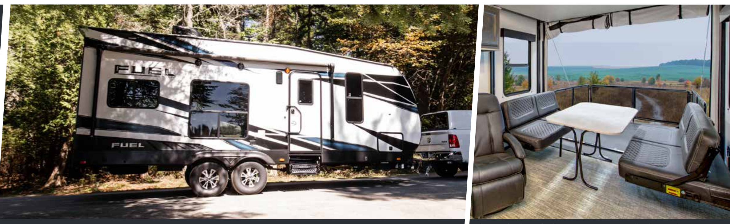
Our Fuel RVs are proudly crafted with Azdel composite sidewalls. Half the weight of wood, environmentally friendly panels lighten your load while increasing your trailer's durability and insulation value. Azdel also resists water, sound and temperature changes, keeping your living spaces comfortable and quiet.