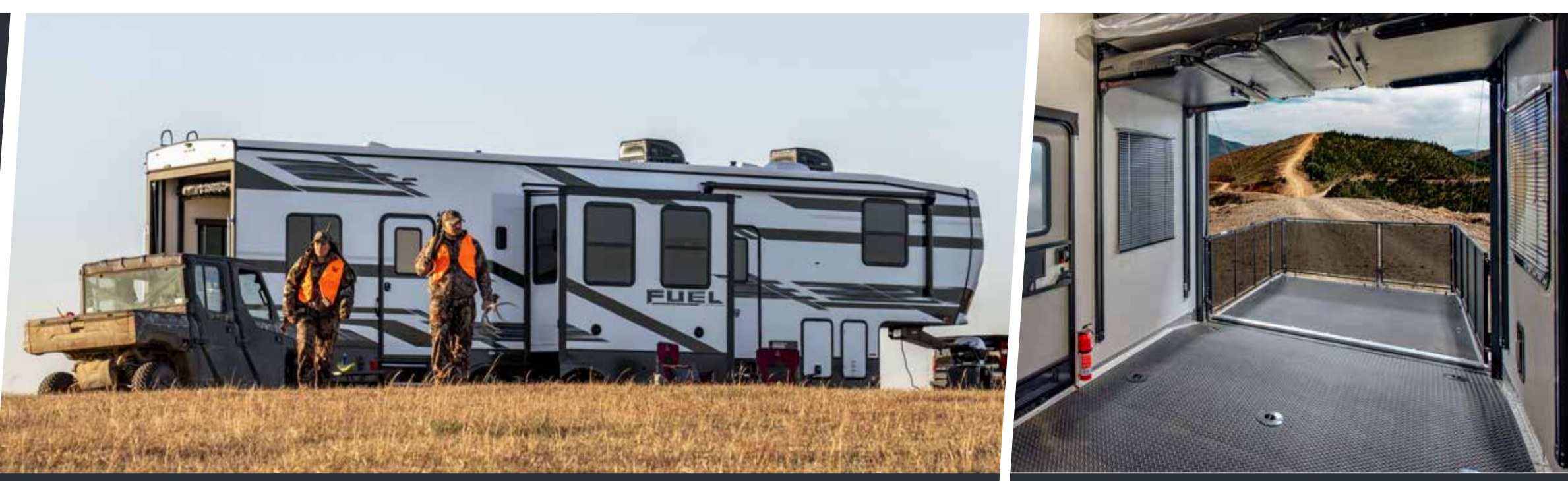
Fuel RVs are proudly crafted with Azdel composite sidewalls. Half the weight of wood, environmentally friendly panels lighten your load while increasing your trailer's durability and insulation value. Azdel also resists water, sound and temperature changes, keeping your living spaces comfortable and quiet.