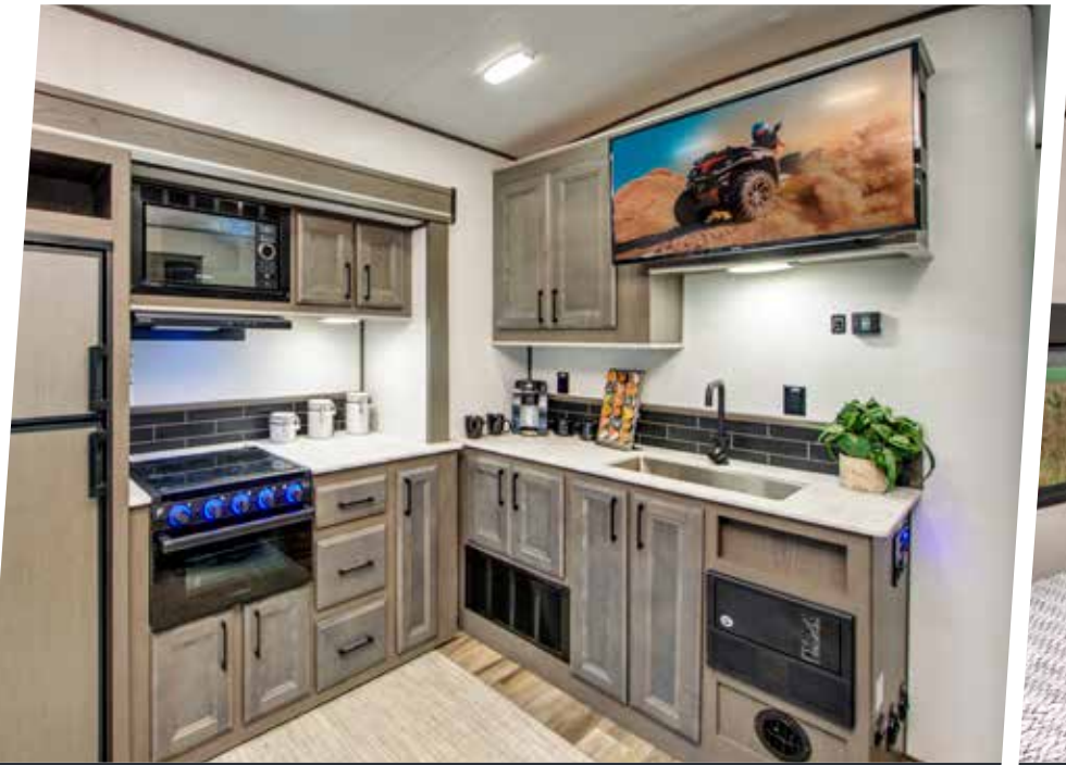
Beautifully designed spacious kitchen with tons of counter space, solid surface countertops and 50" TV placed in optimal viewing position for the entire family.