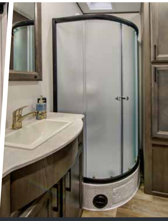
Glass shower enclosure with skylight over the shower adds to the overall feeling of light and space with plenty of storage.

Our travel trailer toy hauler garages come equipped with power drop down queen beds, luxury benches and indoor/outdoor table allowing for extra seating and sleeping while providing plenty of room for your toys.