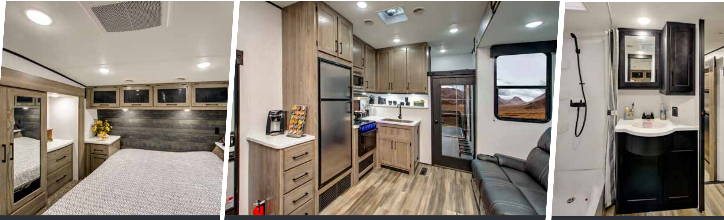
King bed comes standard for your comfort with wireless phone charging ports located on nightstands