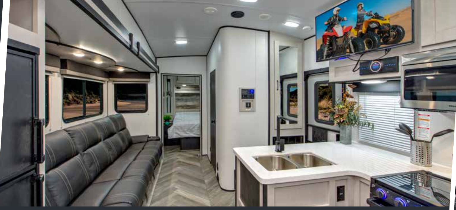
Our Torque travel trailer is crafted with Azdel composite sidewalls. Half the weight of wood, environmentally friendly panels lighten your load while increasing your trailer's durability and insulation value. Torque's new interior has been redesigned and reimagined, giving it lighter finishes, natural wood tones, updated fixtures and no carpet through the entire unit.