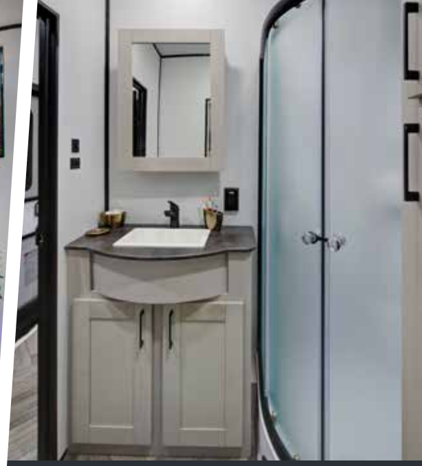
Glass shower enclosure with skylight over the shower adding to the overall feeling of light and space.