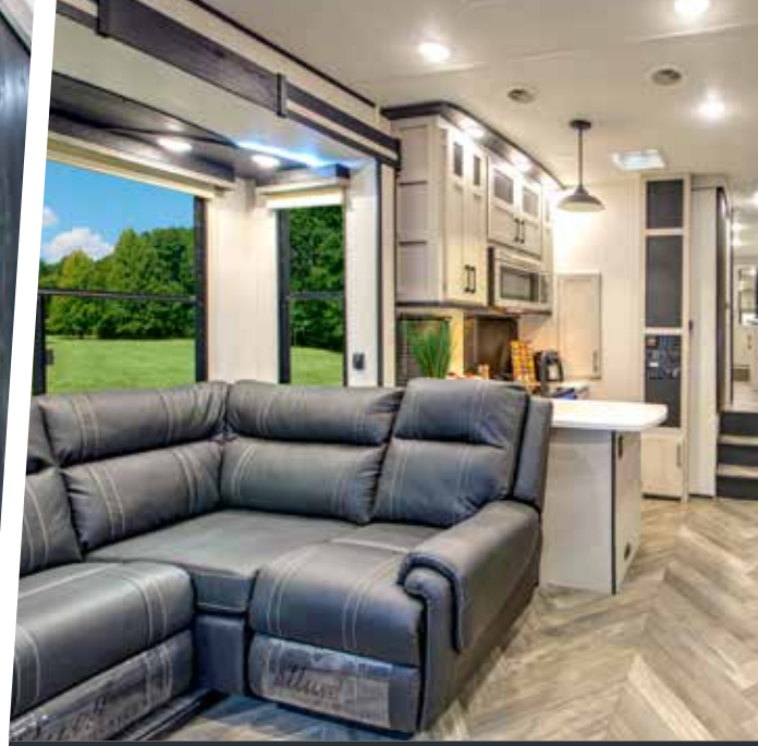
Torque's new interior has been redesigned and reimagined, giving it lighter finishes, natural wood tones, updated fixtures and no carpet throughout the entire unit.