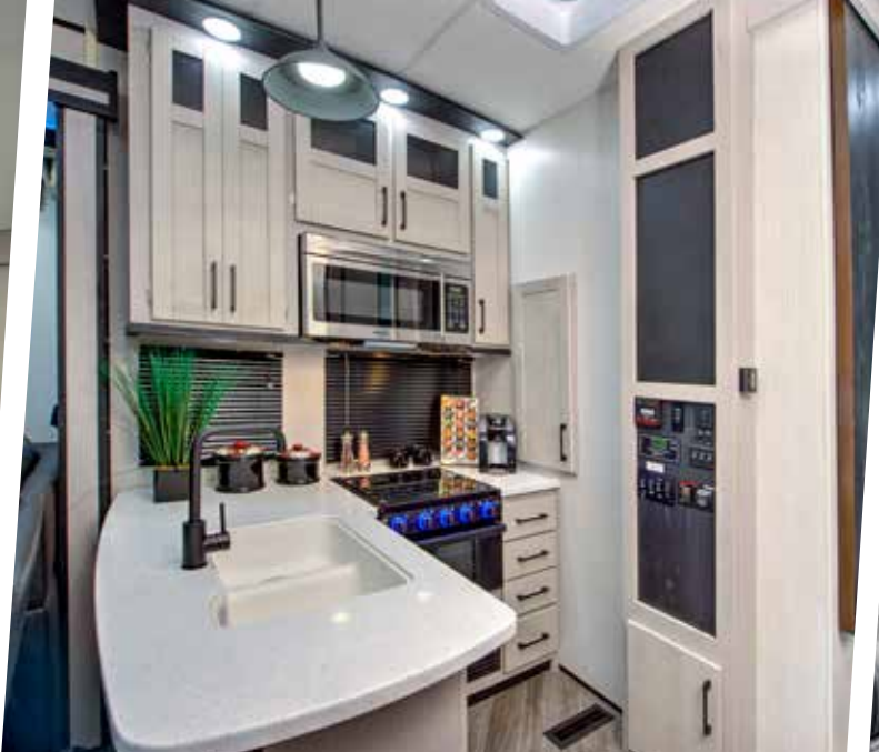
New lightened interior with beautifully designed full height shaker cabinetry with 25% more space.