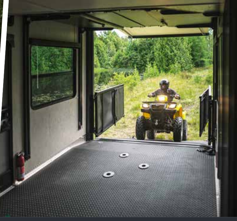
Maximum garage space for all your toys or extra living space. Most of our garages also come with 1/2 bathroom for accessibility.