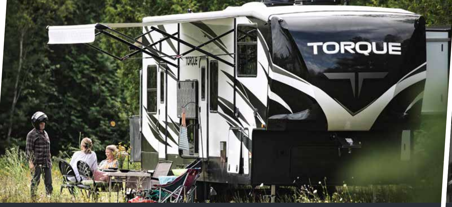
All Torque units are proudly crafted with Azdel composite sidewalls. Half the weight of wood, environmentally friendly panels lighten your load while increasing your trailer's durability and insulation value. Azdel also resists water, sound and temperature changes, keeping your living spaces comfortable and quiet.