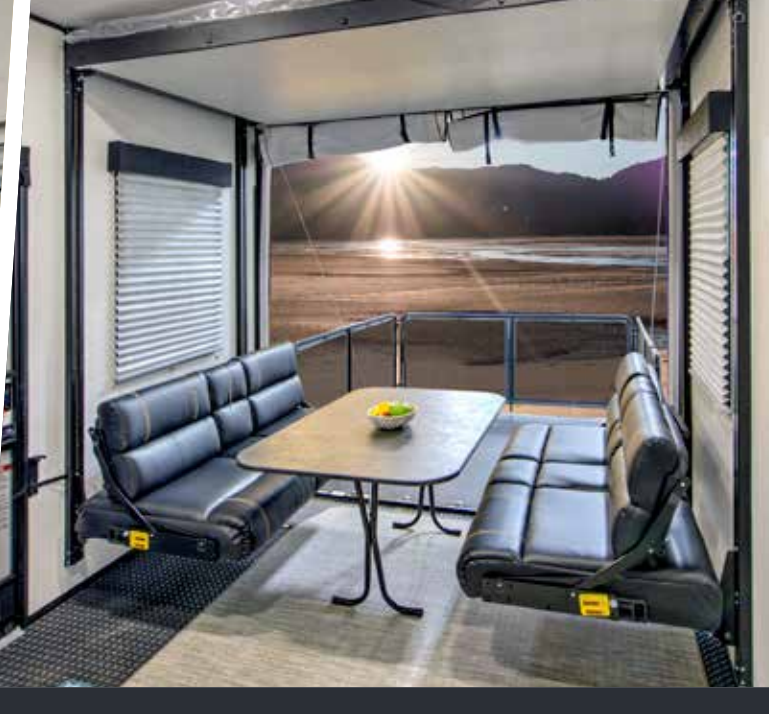
Wide body garage large enough to fit your side by sides with an additional ½ bath, making it the only travel trailer toy hauler available with a ½ bath.