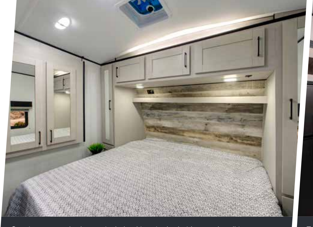
Spacious master bedrooms include a king size bed with enough walking space on both sides.