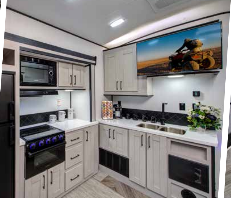
Torque interiors feature beautifully designed kitchens and living spaces that include a residential microwave and a 55 "TV.