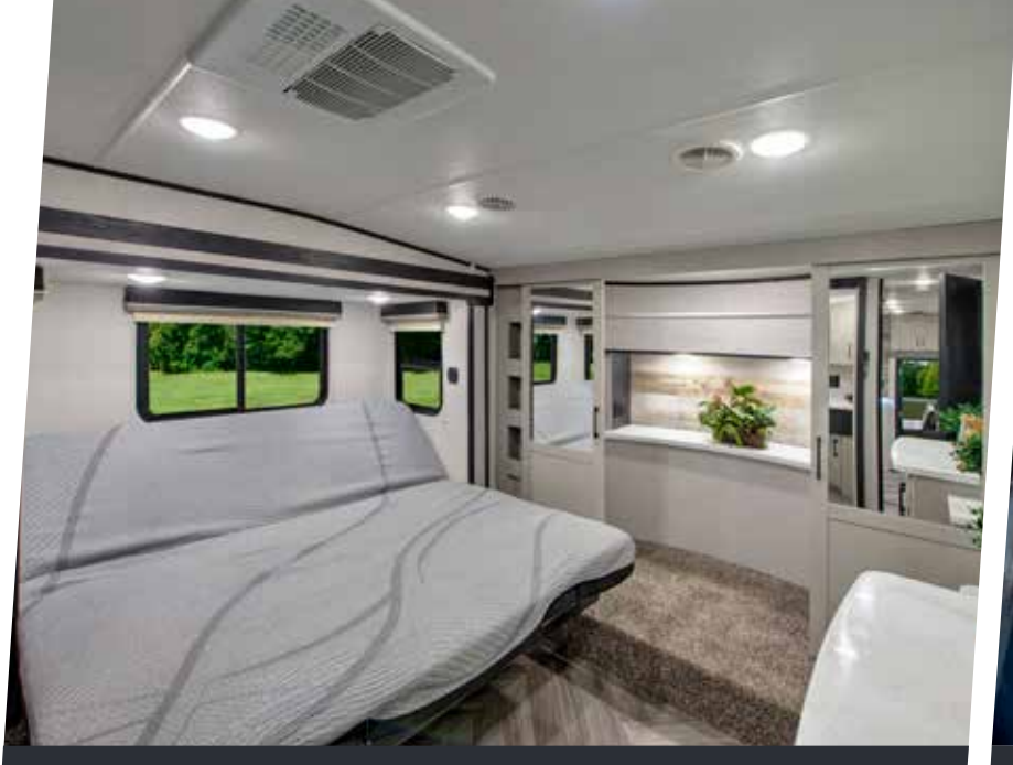
Exclusive bed tilt system facing east to west allowing 30% more floor space. Our bedroom suites feature a walk-in closet and a pull out dresser to create a workstation and hidden TV.