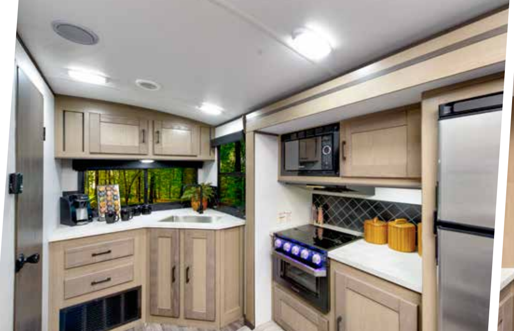
Lighter wood toned cabinets add to the open, airy feeling of the interior space. Standard 10 ft<sup>3</sup> 12V refrigerator (East Coast) and an 8 cubic feet gas/electric refrigerator available (West Coast). Sophisticated flush mounted range has an easy to clean glass top.