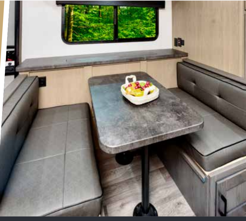
Dream Dinnette - With views of wherever your next adventure takes you, this airy, open dining space is as relaxing as it is functional.