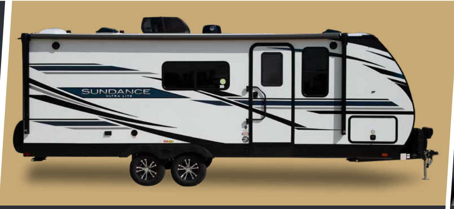
All Sundance units are proudly crafted with Azdel composite sidewalls. Half the weight of wood, environmentally friendly panels lighten your load while increasing your trailer's durability and insulation value. Azdel also resists water, sound and temperature changes, keeping your living spaces comfortable and quiet.