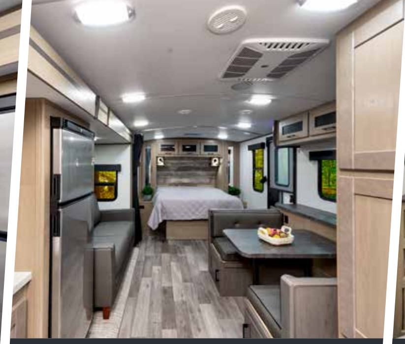
Sleep tight in a full 60"x80" Queen bed with concealed storage underneath. Additional hanging storage helps you stay organized.