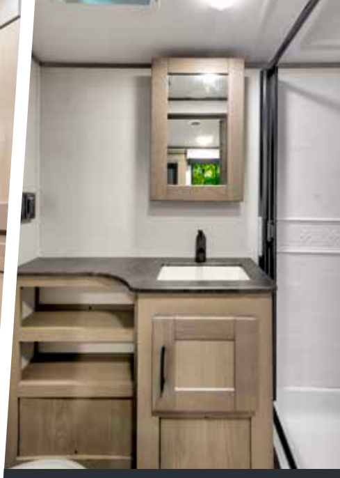
Large bathroom and shower with plenty of storage and skylight over the shower adding to the overall feeling of light and space.