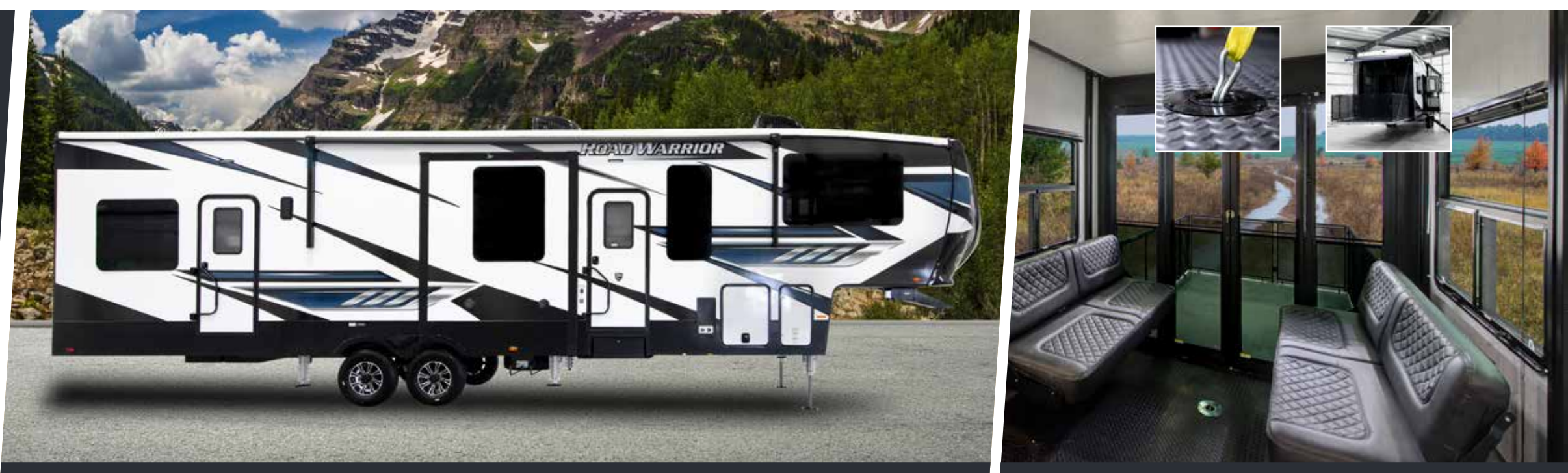
All Road Warrior units are proudly crafted with Azdel composite sidewalls. Half the weight of wood, environmentally friendly panels lighten your load while increasing your trailer's durability and insulation value. Azdel also resists water, sound and temperature changes, keeping your living spaces comfortable and quiet.