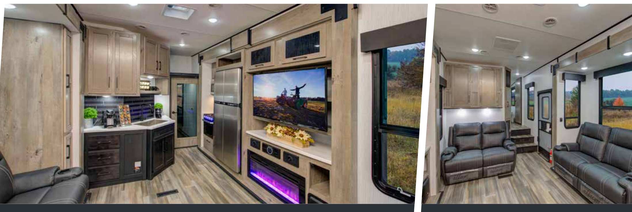
Our Road Warriors have an entertainer's living room and kitchen featuring solid surface countertops, large sinks, hardwood cabinetry, luxury fireplaces (most models) and a JBL sound system with subwoofer.