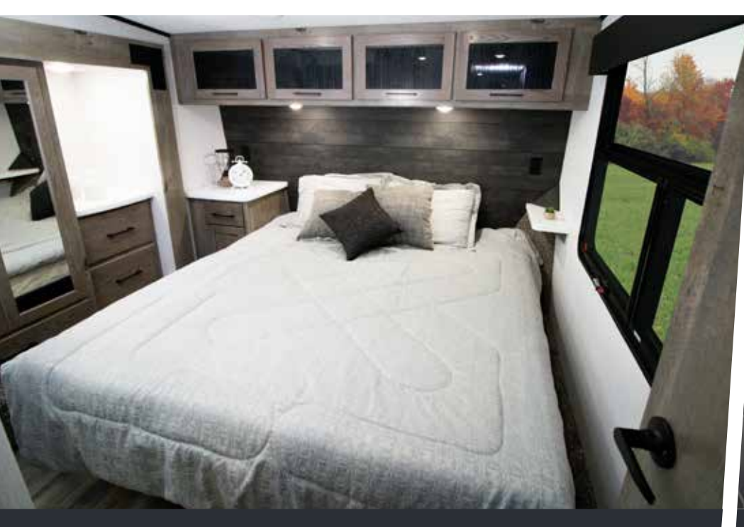
Master suites featuring a beautifully designed headboard with king size bed with overhead storage and bedside wireless charging station.