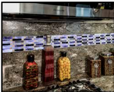
BACKLIT KITCHEN BACKSPLASH TILE