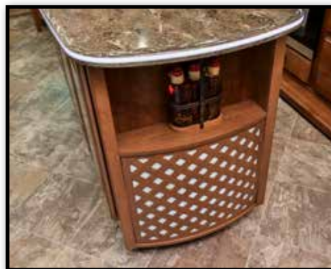
ISLAND END SHELF