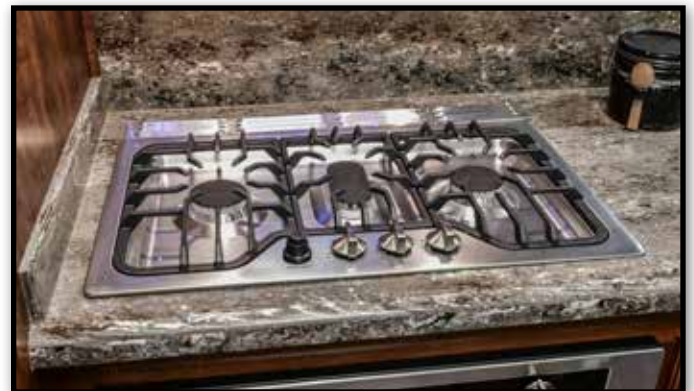
THREE BURNER GAS COOKTOP WITH AUTO IGNITE.