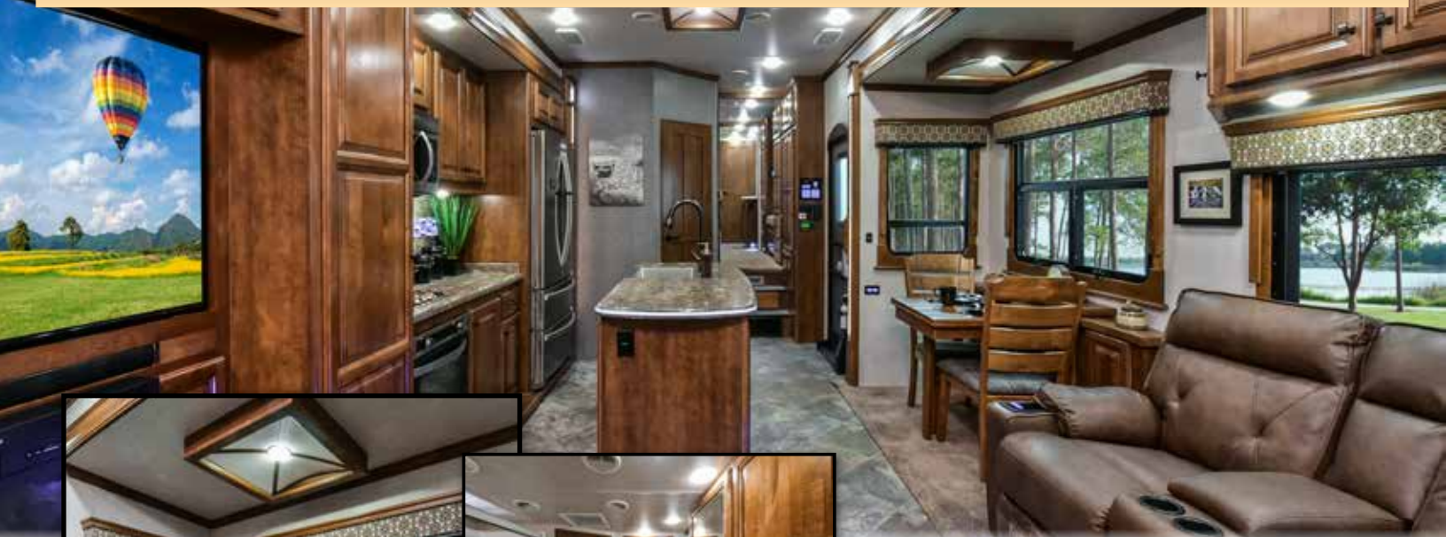
SHOWN IN CHOCOLATE SILK DECOR

ENJOY THE DYNAMIC LIVING ROOM, A BEAUTIFUL FULL BATH AND A HALF, AND THE FULLY LOADED KITCHEN. THE ORIGINAL "365" FLOORPLAN AND STILL ONE OF OUR CORE FLOORPLANS.