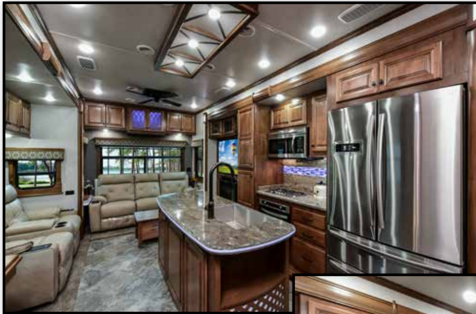
THE OSHKOSH FEATURING ENGLISH TOFFEE DECOR.

NOT ONLY DO WE RESEARCH MARKET TRENDS, RVER LIFESTYLES AND HOUSING IDEAS, BUT WE KNOW A STREAMLINED LAYOUT THAT MAXIMIZES LIVING, EFFICIENCY AND STORAGE IS THE KEY TO DELIVERING THE FULL- TIME RV EXPERIENCE YOU EXPECT.