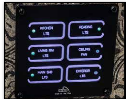
MULTIPLEX LIGHTING SYSTEM