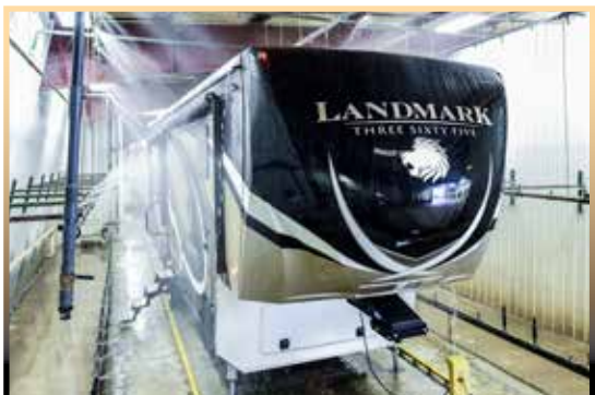
127 SPRINKLER RAIN BAY TEST