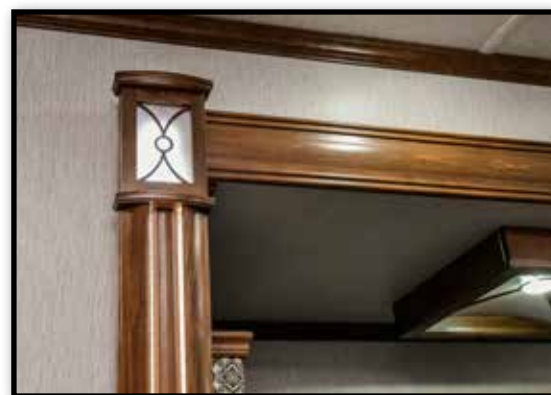
BACKLIT AND DIMMABLE SLIDE OUT FASCIA.

THE BOTTOM LINE IS LANDMARK ADDS LONGEVITY TO YOUR COACH WITH BOTH CONSTRUCTION AND END-USER FEATURES.