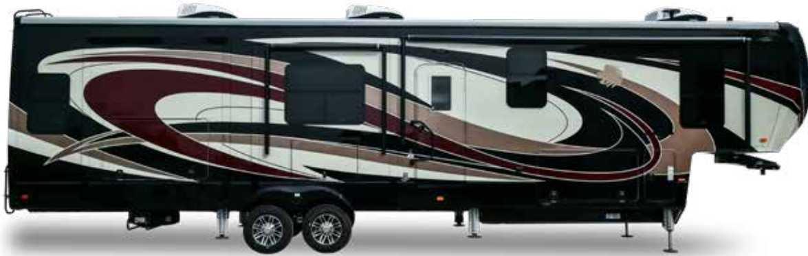
BLACK & RED FULL BODY PAINT

AT LANDMARK BEAUTY IS MUCH MORE THAN SKIN DEEP, BUT WE DO HAVE PLENTY OF EYE CANDY: