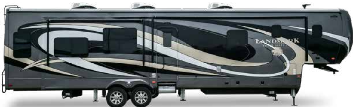
BLACK & SILVER FULL BODY PAINT