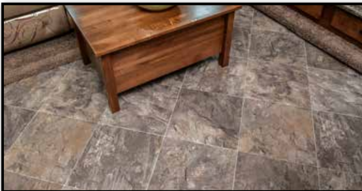
FULLY LAMINATED FLOOR NO WEAK SPOTS.

THE OSHKOSH BEDROOM FEATURES A 40" TV AND A 5100BTU FIREPLACE NEXT TO THE DRESSER.