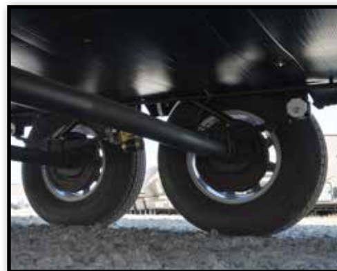
DEXTER AXLES WITH 3-3/8" BRAKES