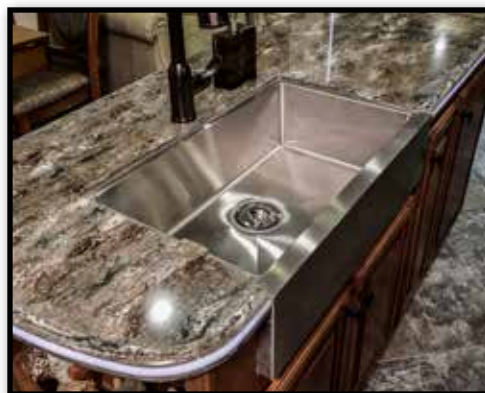
SINGLE BASIN FARMHOUSE SINK