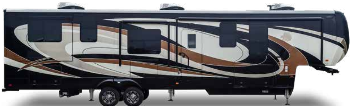
BLACK & COPPER FULL BODY PAINT