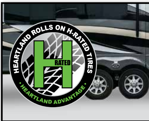
H-RANGE TIRES ON 8,000LBS AXLES

ENJOY A LARGE KITCHEN WITH FLOOR TO CEILING PANTRY, A MASTER SUITE WITH 20" DEEP DRESSER, WALK IN CLOSET AND POWER TILT BED FOR MAXIMUM COMFORT AND STORAGE. PHOENIX ALSO FEATURES A RAISED REAR DEN ABOVE AN ENORMOUS BASEMENT STORAGE AREA WITH MOTOR HOME STYLE PULL-OUT TRAY STORAGE.