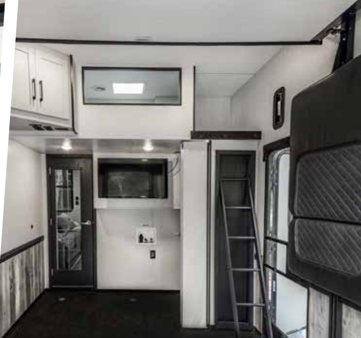
Most Cyclones feature garage facing lofts with a 1/2 bath.