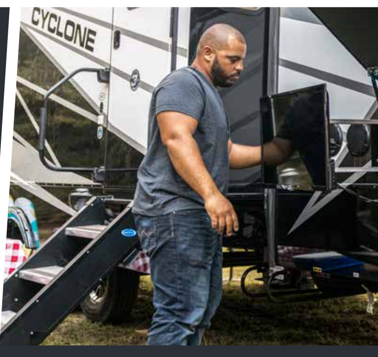
The Azdel and aluminum components of our laminated sidewall weigh less by using heavy and less durable materials. Our Cyclone's also feature the