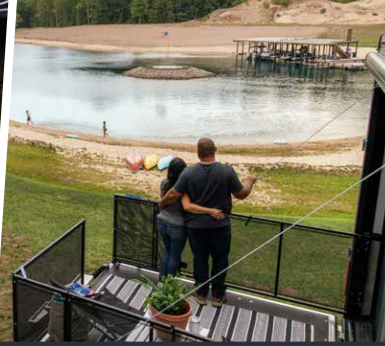
Cyclone garage space is a multi-purpose room creating plenty of space for toys, workouts, schooling and entertaining.