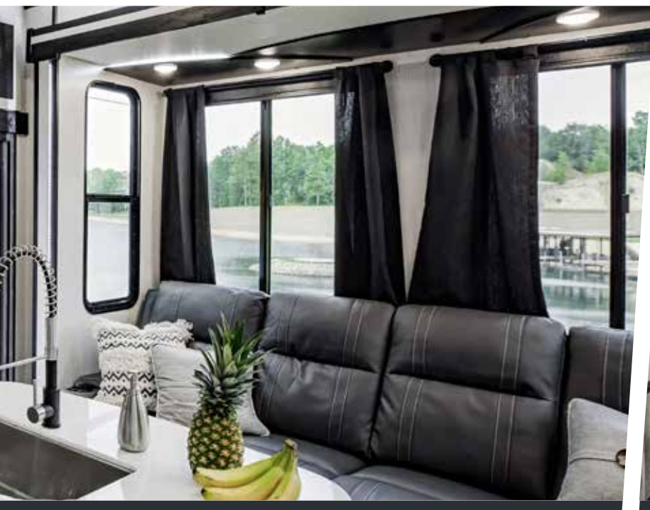
gined, giving it lighter finishes, neutral wood tones, updated fixtures in matte black, in and workspace.