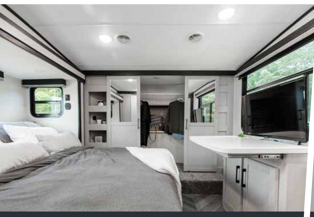
Exclusive bed tilt system facing East to West allowing 30% more floor space. Our bedroom suites feature a walk-in closet and a pull out dresser to create a workstation and hidden TV.