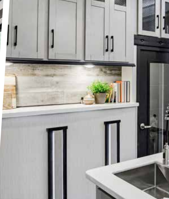
Cyclone's new interior has been redesigned and re-ima sunlight adjustable blackout shades and culinary kitche