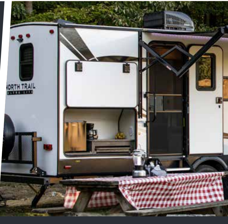
The Azdel and aluminum components of our laminated sidewall that others are sacrificing by using heavy and less durable mater