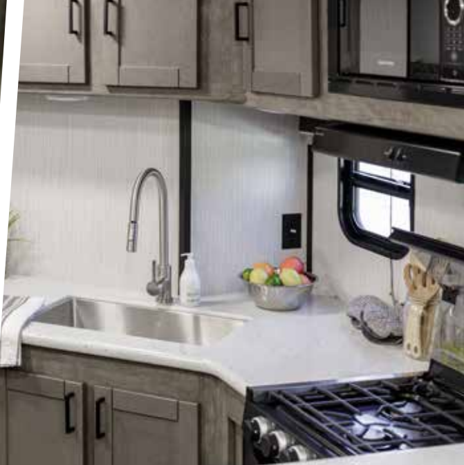
Our kitchens are equipped with Infinity edge countertops, stainless steel sink and top of the line appliances.