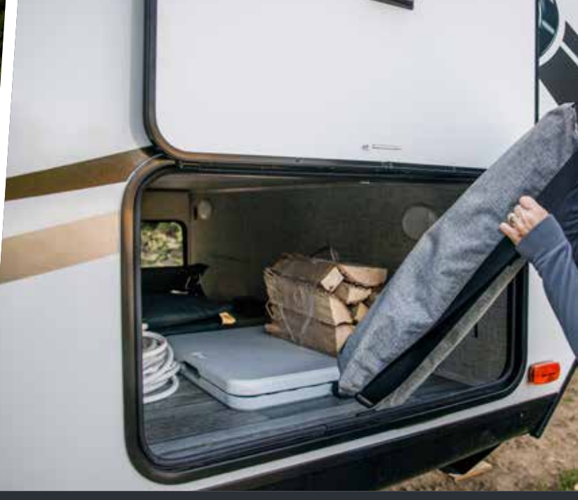
When it comes to RVing, storage is at a premium. Our King Kong sized pass through storage provides you with up to 67.5 cubic feet of storage.