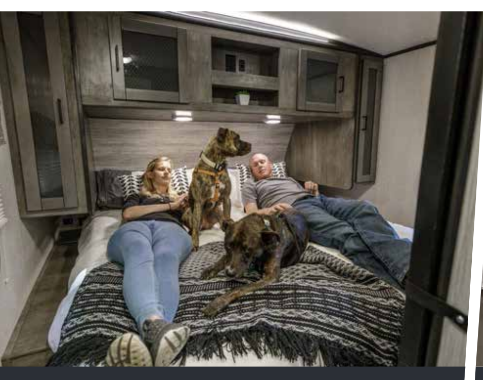
All bedrooms come standard with a residential headboard, under-bed storage and outlets on both nightstands.