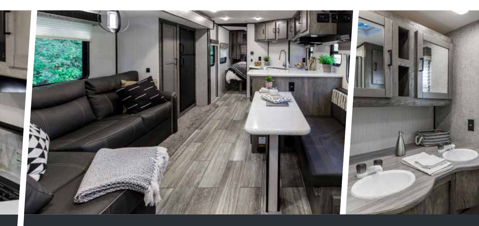
Fresh new interior with lighter floors and cabinets, designer accent walls, upgraded furniture and additional lighting features.